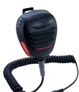
Submersible Mic Plug