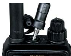
Waterproof Connectors and Microphone Jack